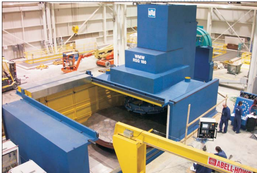
RSG 4570 vertical rotary surface grinder